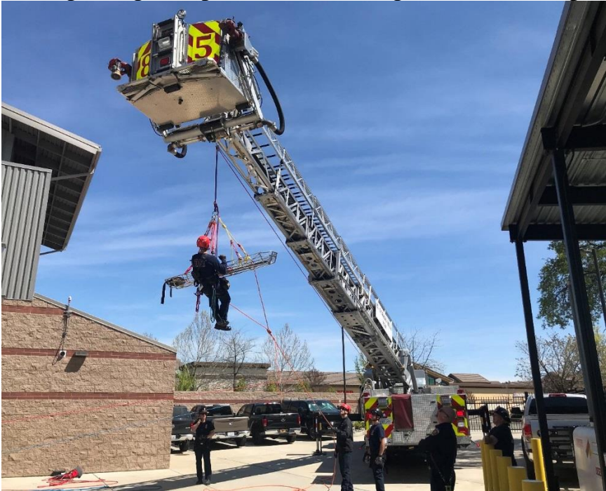
Annual High-Angle Rope Rescue Training, Station 84 – April 2019